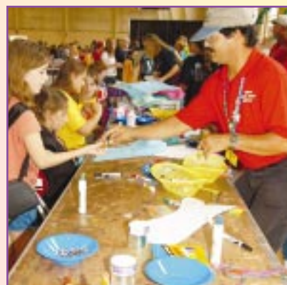
Kids did crafts for tokens at Florida's creativity booth.

17 Associations had booths at the Creativity Festival. Participants used OotM tokens at the booths. The booths that collected the most tokens won a prize.