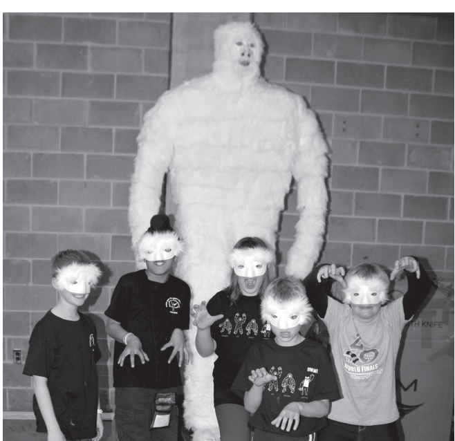
The white fur of Maine's "Fredi the Yeti" float was put on by students at their State Tournaments.

"After disassembling, this whole thing will