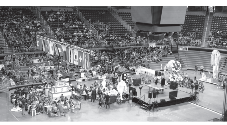
The 2019 Float and Banner Parade celebrated the unique diversity and unity of World Finals.

Japan South Korea Colorado Delaware Georgia Maryland Maine New Jersey New York Texas