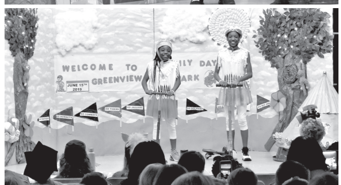
Opposites Distract, Top: Leonardo's Workshop Bottom: Leonardo's Time and Present Day