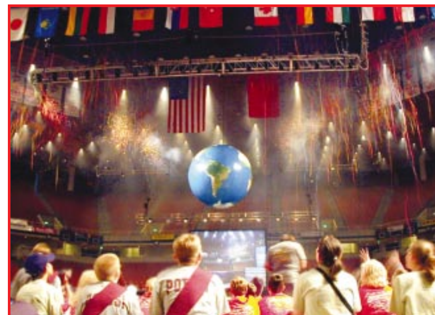
World Finals Opening Ceremonies at Iowa State University's Hilton Coliseum ended with a flash and a bang as fireworks lit the stage and colorful confetti filled the arena. The spectacle matched the spirit in the air as teams were eager to get the competition off to a start.