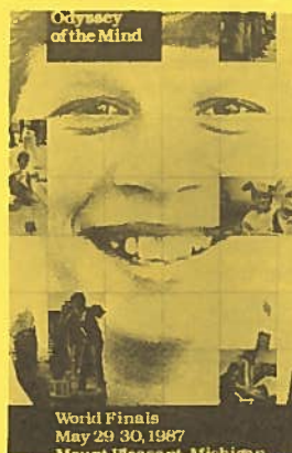
Colored posters like this one were given to attendees at World Finals