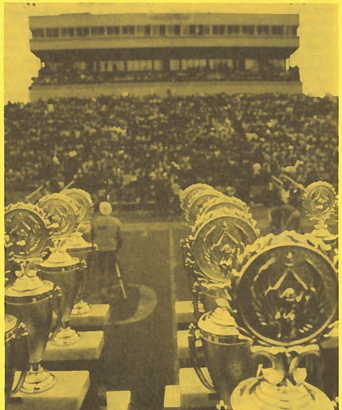
1987 World Finals Award Ceremony

AR: Rogers Junior High School, El Dorado BC: Gleniyon-Norfolk Schook, Victoria MA: Barnstable's Gateway Prog, Hyannis MA: Melrose Junior High School, Melrose MD: Thomas Stone High School, Waldorf MI: Frost Elementary School, Jackson MT: Park High School, Livingston NE: Wahoo Elementary School, Wahoo NH: Inter-Lakes Elementary School, Meredith NV: Washoe County AT Program, Reno NY: Brockport Middle School, Brockport PA: Makefield School, Makefield TX: Target Program, Tyler VT: St. Johnsbury Middle School, St. Johnsbury