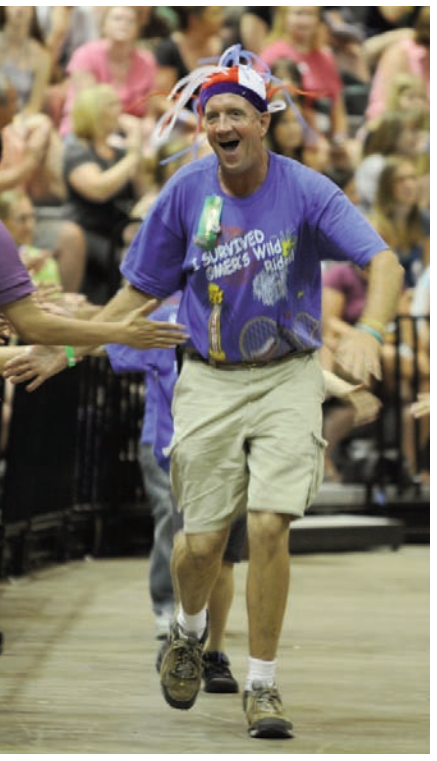
An excited DoDDS Europe team gets ready for competition. A coach runs to the stage with his team to collect an award. OMER housed in the eye of a needle.