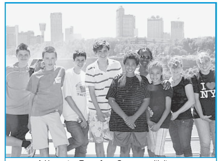
A Homestay Team from Germany with its new Odyssey friends from New York.