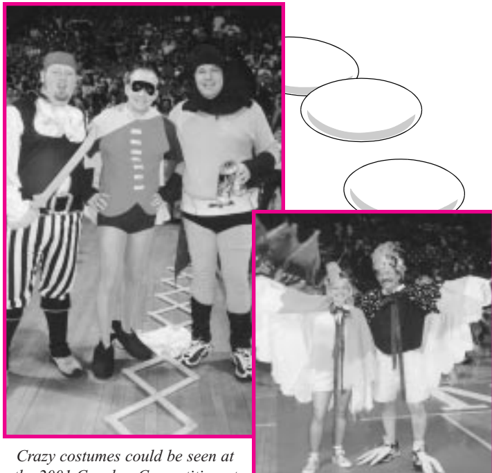
Crazy costumes could be seen at the 2001 Coaches Competition at the University of Maryland.