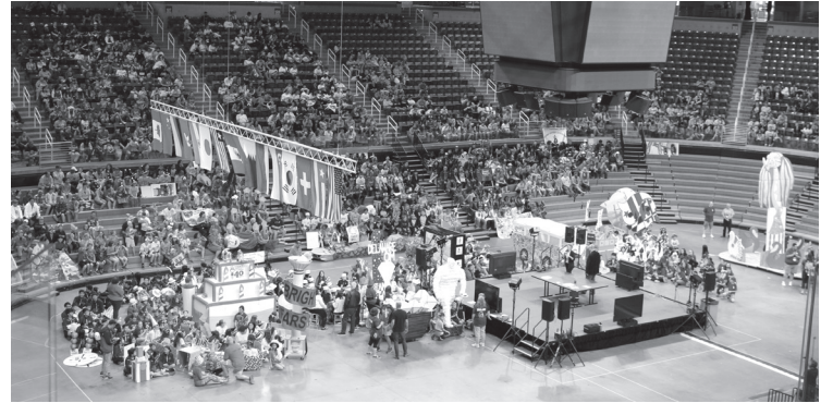
The 2019 Float and Banner Parade celebrated the unique diversity and unity of World Finals.

The Breslin Center arena was awash with mascots, colors and history of World Finals' associations represented at Thursday evening's Float and Banner Parade, led by grand marshal, OMER. From Maine's "Fred the Yeti" float to Kentucky's "May the Horse Be With You," Star Wars-meets-Derby banner, the parade's many entries demonstrated an impressive array of creativity, association pride and big fun!