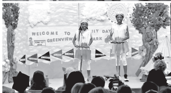
Opposites Distract, Top: Leonardo's Workshop Bottom: Leonardo's Time and Present Day