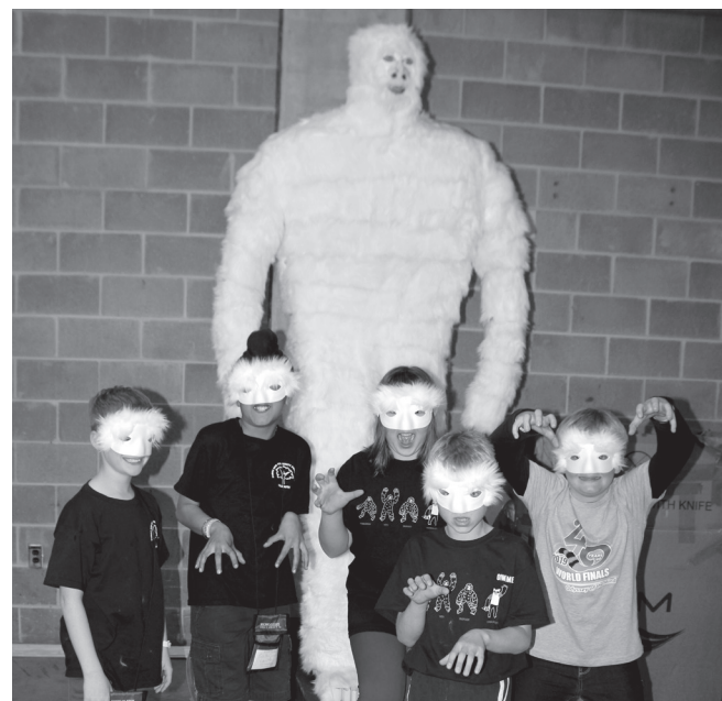
The white fur of Maine's "Fred the Yeti" float was put on by students at their State Tournaments.

USPS will be onsite at the International Center with the customized World Finals cancellation stamp for 2019! Please stop by to pick up your postcard and send a note home with a piece of the 2019 event. Stamps will be for sale near the Odyssey Information table today from 9am-1pm. Cancellation stamp will be available at the East Lansing post office (1140 Abbot Rd, East Lansing, MI 48823) after that until 7pm on weekdays and 9am-3pm on Saturday.