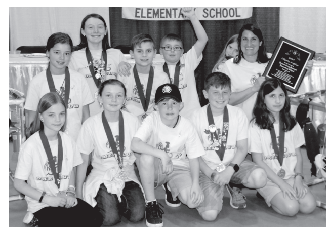
The 2019 Odyssey Angels of Remsenburg-Speonk Elementary School.