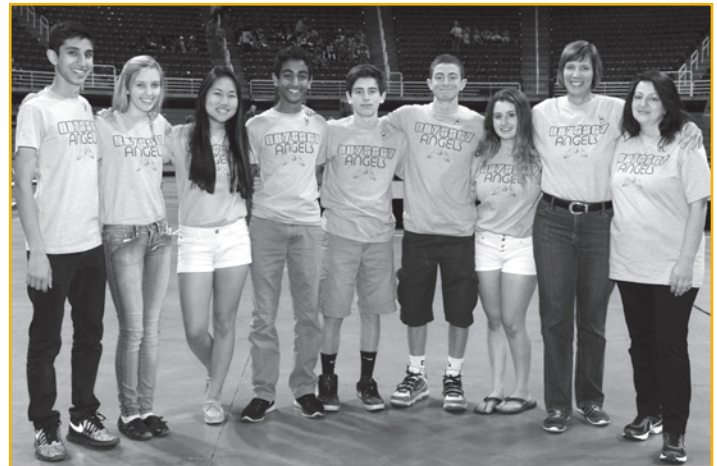
The Barrel of Makers Angels getting ready to accept their medals on stage at the 2015 Opening Ceremonies.

“The thing I liked most about being an Odyssey Angel was being able to see the smile on people’s faces that we helped. Knowing that I