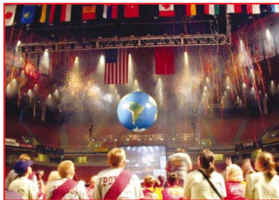
World Finals Opening Ceremonies at Iowa State University's Hilton Coliseum ended with a flash and a bang as fireworks lit the stage and colorful confetti filled the arena. The spectacle matched the spirit in the air as teams were eager to get the competition off to a start.